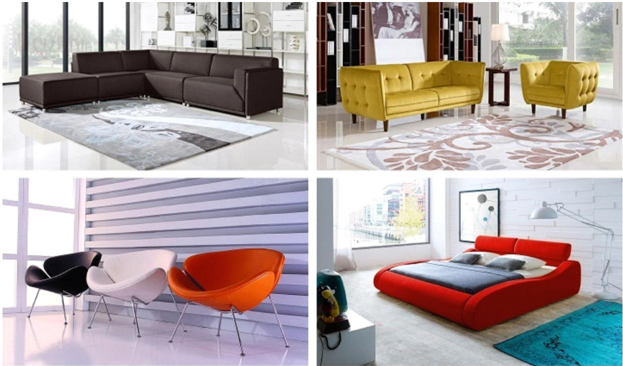
Selected Products from our Collections

We market and develop modern home furniture for today’s middle class, urban consumer in diverse markets worldwide. Our product offerings feature urban contemporary styles offering comfort and functionality in matching furniture collections and upscale luxury pieces appealing to lifestyle-conscious middle and upper middle-income consumers. Many of our products are part of multi-piece lifestyle collections in distinctive styles targeted at the medium and upper-medium price ranges and feature upholstered, wood and metal-based residential furniture pieces. We classify our products by room; or series, including living room, dining room, bedroom and home office, and by category or piece such as sofas, chairs, dining tables, beds, entertainment consoles, cabinets and cupboards. Our largest selling product categories in the year ended December 31, 2016 were sofas, beds and dining tables, which accounted for approximately 61%, 11% and 7% of 2016 sales, respectively. For the year ended December 31, 2015, our largest selling product categories were sofas, dining tables and beds, which accounted for approximately 36%, 15% and 14% of sales, respectively, of 2015 sales. Our products are manufactured primarily from medium-density fiberboard, or MDF board, and particleboard covered with veneers or lacquers and combined with other materials, including steel, glass, marble, leather and fabrics.